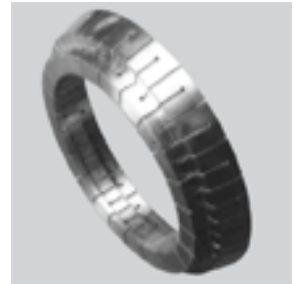
*27" I.D. Master Collet Shown

Send your collet prints or specifications for a complete review. With over 20 years of reliable experience, we respond promptly with intelligent and practical solutions. Simply telephone, email, or fax.